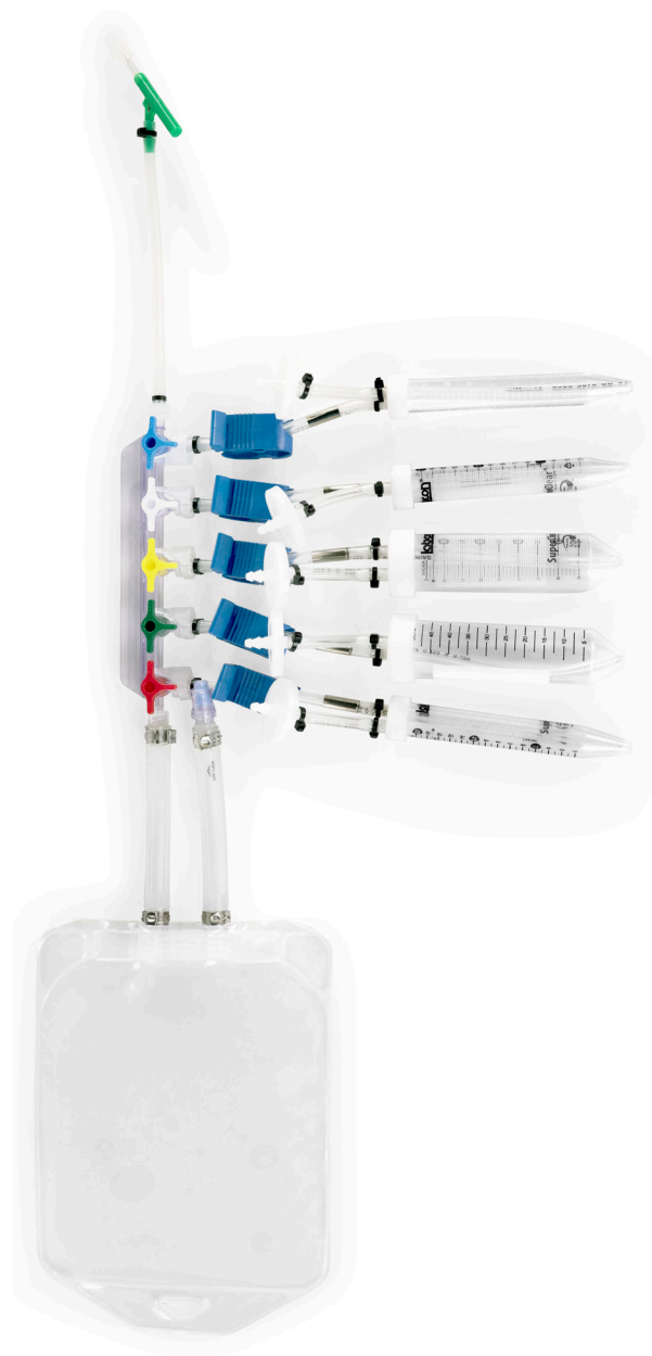
SAMPLING NEEDLE ASSEMBLY