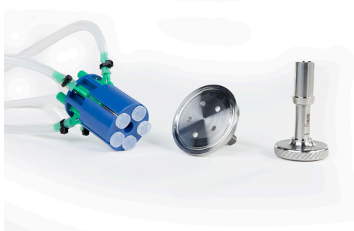
5-PORT SAMPLING NEEDLE HOLDER 1MM AND 2MM SAMPLING NEEDLES